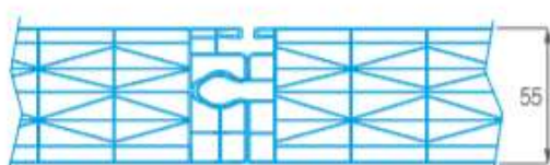
section panel / panel joining