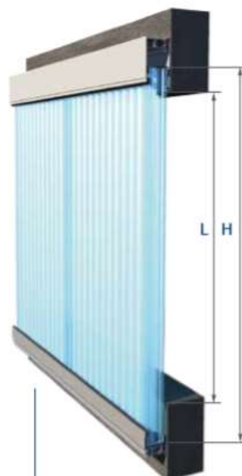
External installation without sill

H = L - 35 \text{ mm} (simple profiles) H = L - 95 \text{ mm} (thermal cut profiles)