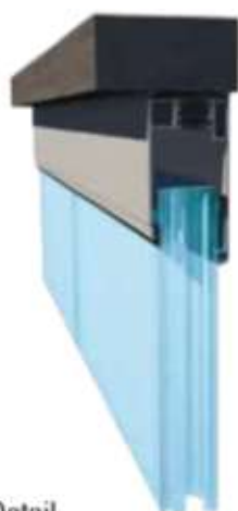
Detail of the upper thermal cut profile

H = L + 108 \text{ mm} (simple profiles) H = L + 135 \text{ mm} (thermal cut profiles)