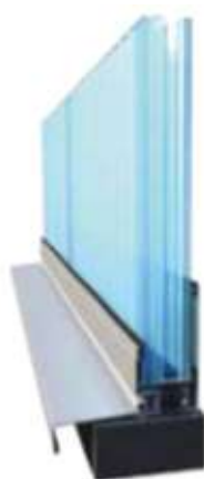
Detail of the lower thermal cut profile with sill