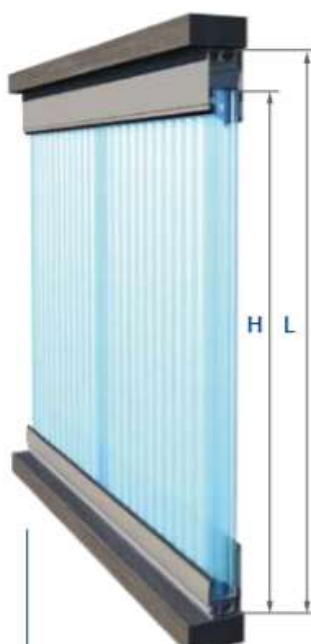
Installation within supports without bottom sill

H = L - 40 \text{ mm} (simple profiles) H = L - 95 \text{ mm} (thermal cut profiles)