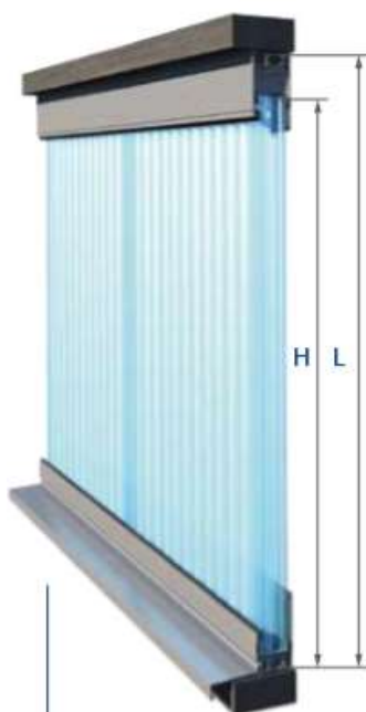
Installation within supports with bottom sill

H = L - 40 \text{ mm} (simple profiles) H = L - 95 \text{ mm} (thermal cut profiles)